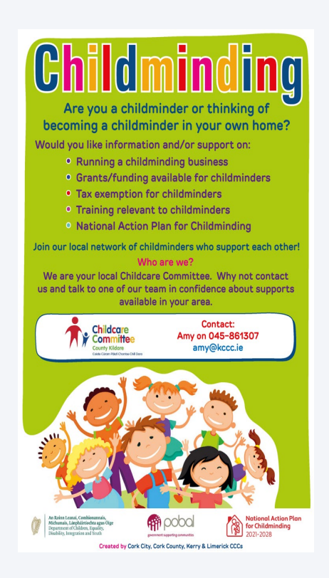
A flyer developed to promote our childminding supports