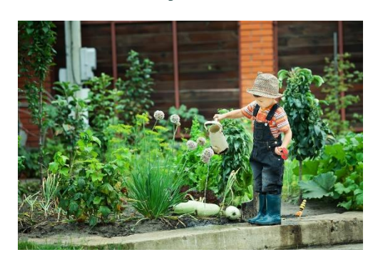
Update 3, April 2021